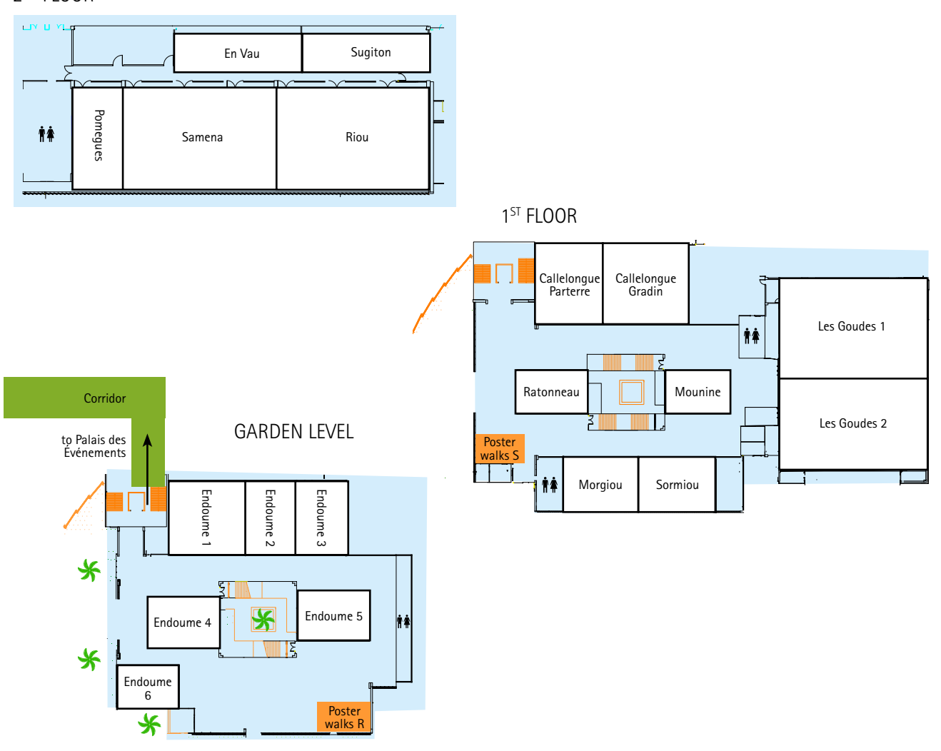
PALAIS DES CONGRÈS